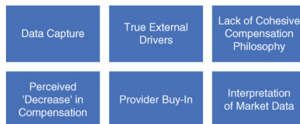
Figure 3: Challenges of the volume-to-value shift on compensation models