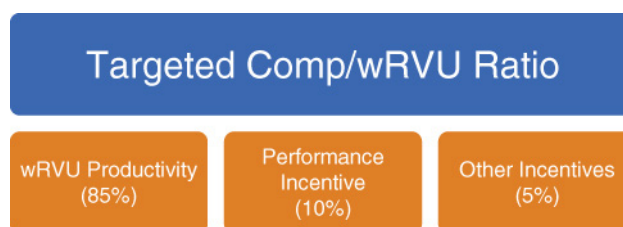
Figure 4: Illustration of integrated approach

For an illustration, let us assume that the targeted compensation per wRVU ratio is US$50.00 and that 85 per cent is tied to wRVU productivity, so the straight wRVU-based component would be worth US$42.50. Then the performance incentive would be worth US$5.00 per wRVU, and